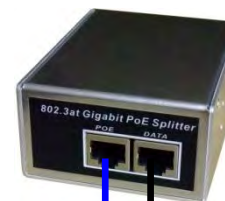
PoE Splitter PDS-GD024-12