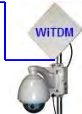
PSE: PoE Switch or PoE Midspan